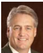
PAUL LAGE NORWOOD PROMOTIONAL PRODUCTS

We asked members of our Power 50 list to reveal how they ramp up their own creativity. Check out their responses.