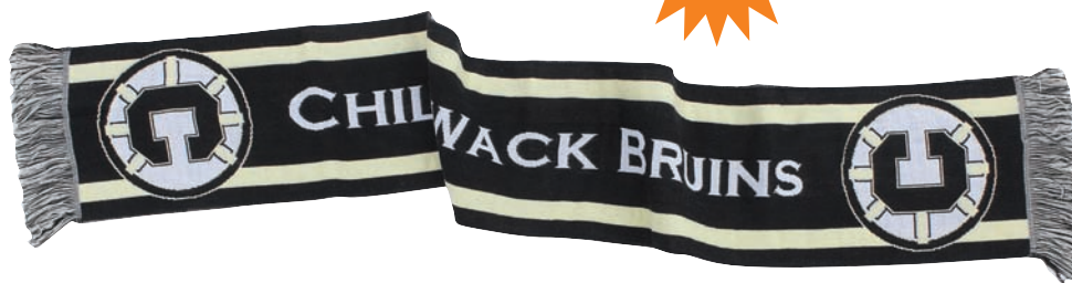
Woven acrylic stadium scarf with 2" fringe billboards school spirit while keeping the wearer warm. Measures 52" x 8". From BamBams, asi/38228, 866-913-4463.