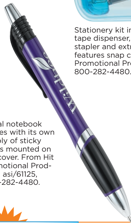
The Samba ballpoint pen features silver accents, a black grip and a blue, green, yellow, red or purple barrel. From Hub Pen Company, asi/61966, 800-388-2323.