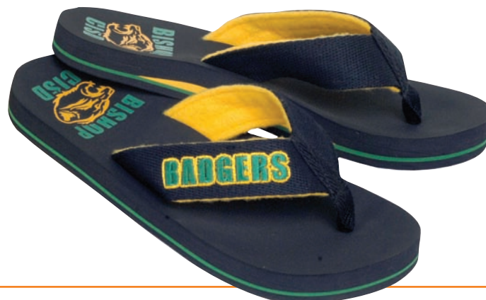
Bali surf-style flip-flop features a fleece-lined, embroidered acrylic strap and a three-layer sole with a recessed logo or message. From Neet Feet, asi/73525, 760-721-1944.