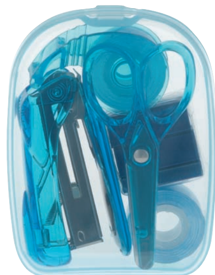
Stationery kit includes scissors, tape dispenser, extra roll of tape, stapler and extra staples. Case features snap closure. From Hit Promotional Products, asi/61125, 800-282-4480.